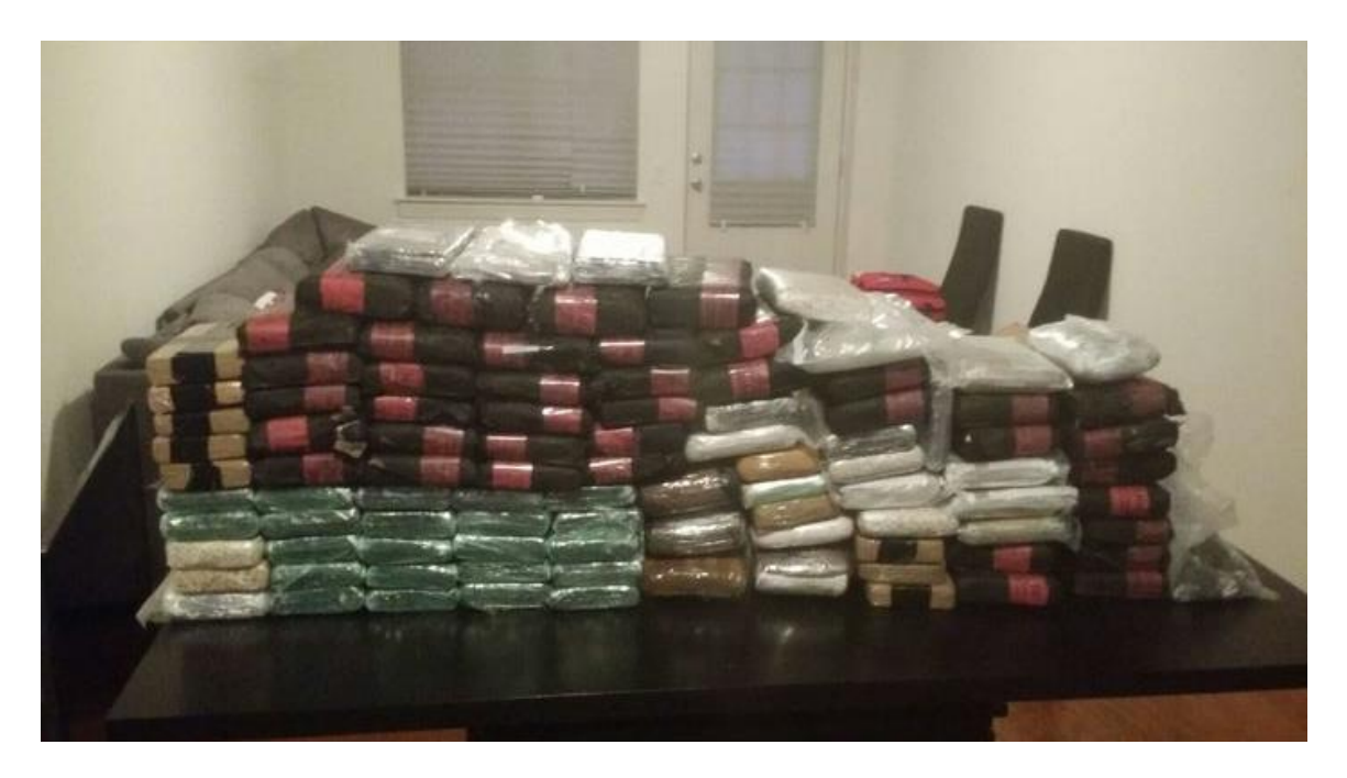
In 2017, an investigation by SNP, DEA and NYPD uncovered more than 200 pounds of narcotics, including 140 pounds of fentanyl, stashed in an apartment in Kew Gardens, Queens. This was the nation's largest fentanyl seizure at the time.

recovered in the U.S. at that time (since surpassed by U.S. Customs and Border Protection in Arizona). A total of 97 kilograms of narcotics (213 pounds) were stashed in a inconspicuous apartment in Kew Gardens, Queens, including 64 kilograms of fentanyl (over 140 pounds) and quantities of heroin, cocaine and other substances. A married couple linked to a Mexican source of supply was prosecuted.